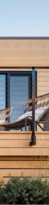
Building in the Seadrift community presents unique environmental challenges.